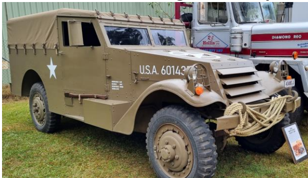
1942 White Scout Car