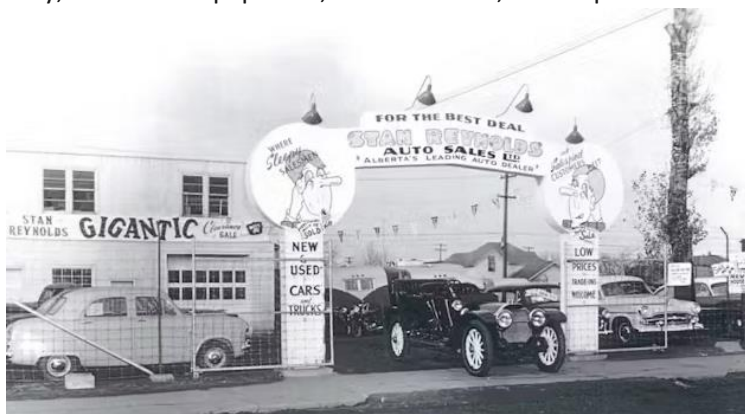
An early addition to the collection at the 'Auto Mile'. The sign reads: "Here sleepy salesman and satisfied customers exit!"