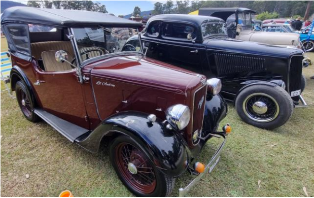
Austin 7 – “Lil’ Audrey”