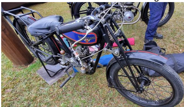
1933 Motobecane Model B2U 175 c.c.m/cycle