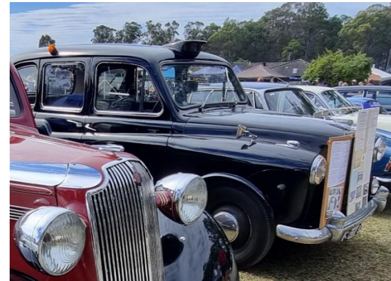
Austin London Cab