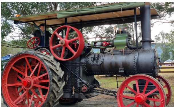
1911 Ruston Proctor Steam Traction Engine