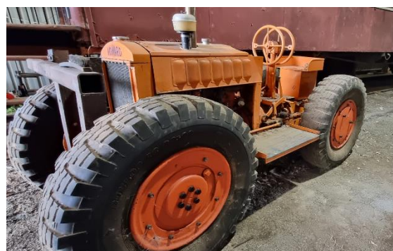
Howard railway tractor (Glenreagh Mountain Railway)