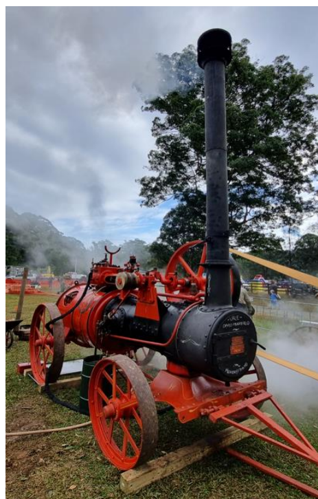
1910 Marshall / Britannia Portable Steam Engine